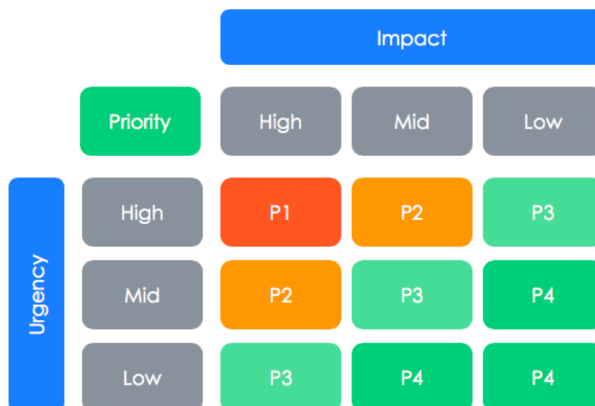
Priority Classification Matrix Diagram